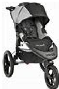
Baby Joggers & Strollers