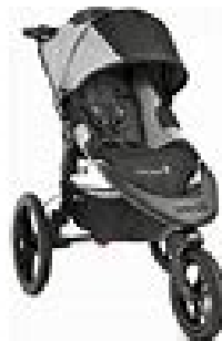
Baby Joggers & Strollers