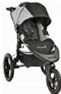
Baby Joggers & Strollers