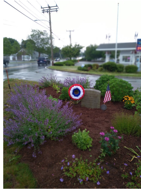
Spreading Mulch with the Chief

Both gardens have been planted with new flowering plants with the intention of making them pollinator gardens to attract butterflies and bees. Again thank you to the team that spent a number of Saturday mornings at these locations to make this happen.