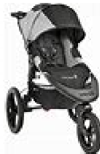
Baby Joggers & Strollers