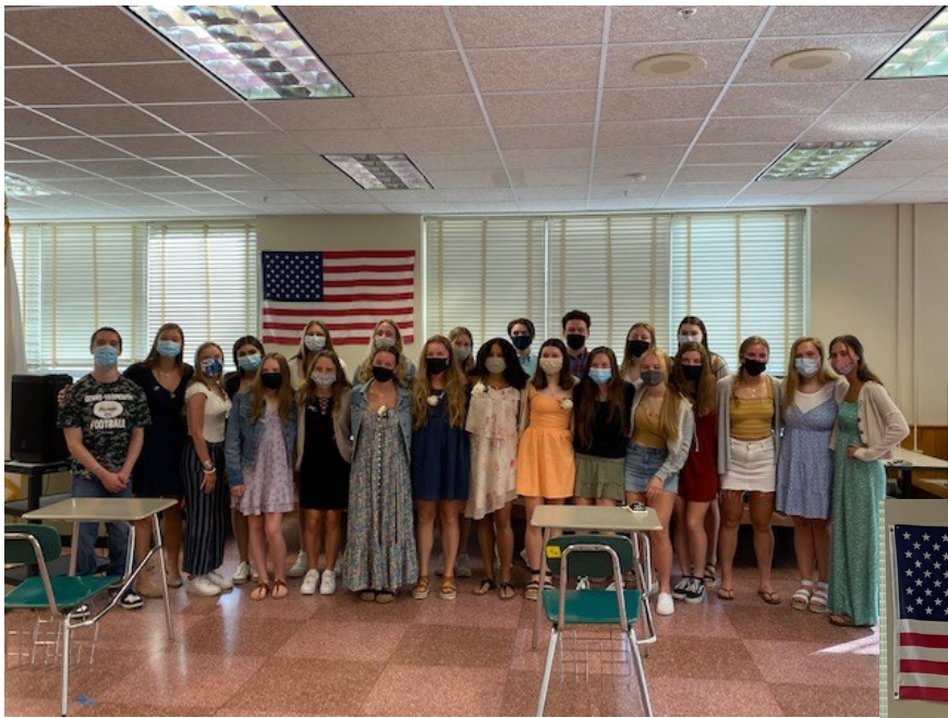
LEFT: The DY Interact Club for 2020-2021