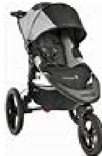
Baby Joggers & Strollers