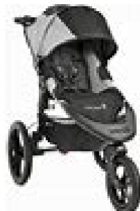
Baby Joggers & Strollers