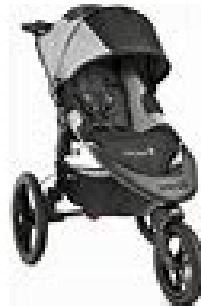
Baby Joggers & Strollers