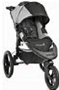
Baby Joggers & Strollers