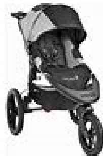
Baby Joggers & Strollers