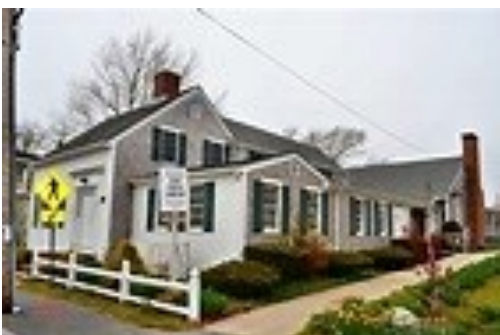
Left : South Yarmouth Library

Their discussions are in regards to creating a new centralized 21 st centralized library. Discussion to merge the 2 libraries facilities and staff to create a better way