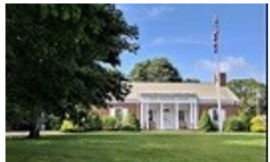
Right: West Yarmouth Library