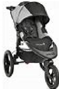
Baby Joggers & Strollers