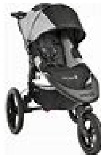
Baby Joggers & Strollers