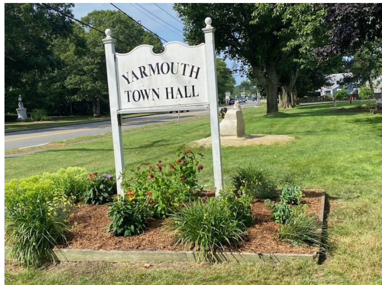
THE FINAL GARDEN

STAY TUNED FOR MORE TO FOLLOW AS WE MAKE PLANS FOR OTHER IMPROVEMENTS