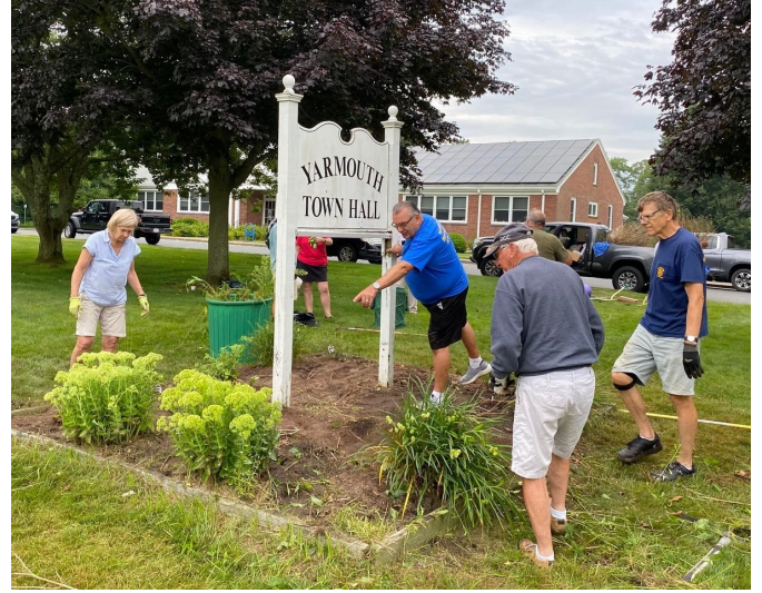
CLEARING AND LOOKING FOR THE BEES