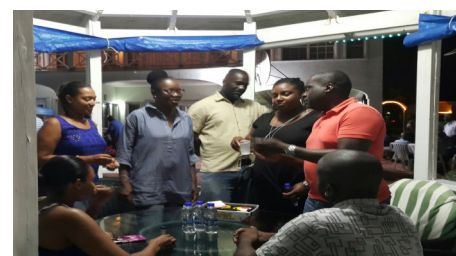
It's all about Taboo ! Fun! Fun! Fun!