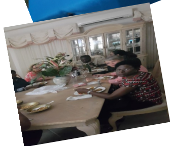
Some members preferred the air conditioned comfort.