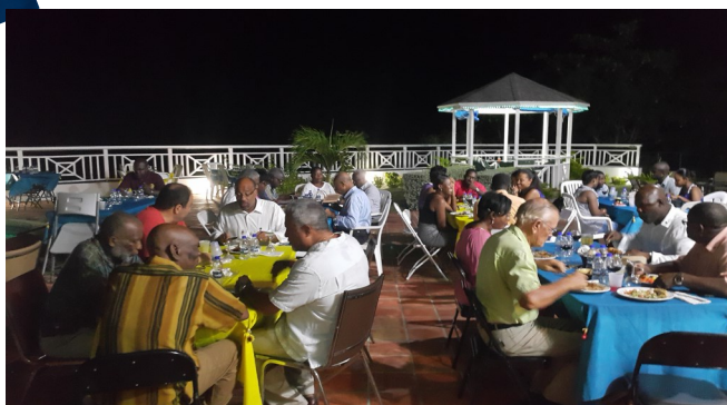
FUN! FOOD! FELLOWSHIP!