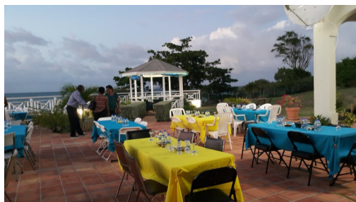
The Sarge is on Point. First person to arrive.