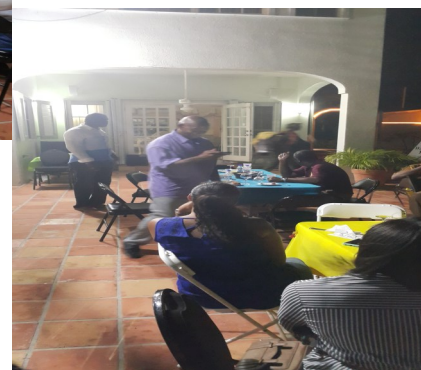
Always depend on PP Cordel for those funnies! This time...'3 Drunks in a Taxi!'