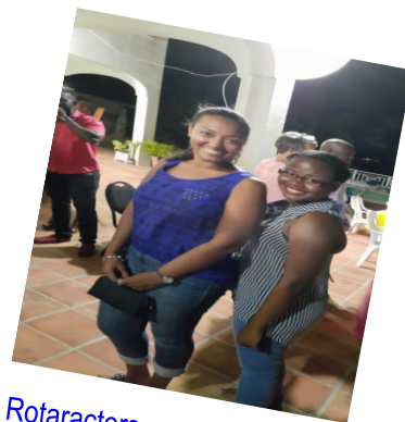
Rotaractors posing for pic!