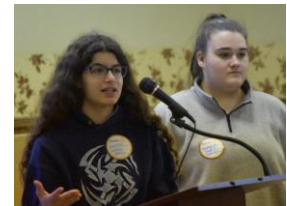
Visting Interact students!

https://www.signupgenius.com/go/805084AA8AD29ABFE3-48541420-hank