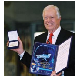
Jimmy Carter's Nobel Peace Prize in 2002.

One of Jimmy's Carter's greatest awards was the Nobel Peace Prize, which he received in 2002 in recognition of his decades of work advancing peace and human rights. Carter redefined what it means to be a retired president – and the country's longest-lived one at that, having surpassed Herbert Hoover (who lived 31 years after leaving the White House). During his presidency, Carter made a commitment to human rights the cornerstone of his foreign policy; he and his wife, Rosalynn, continued that emphasis when they founded the Carter Center in 1982. The center's programs revolve around two main themes: peace and health.