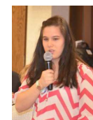
West Allis Hale - Bella