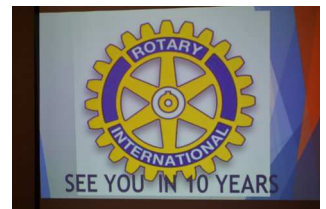
In ten short years, our club will be celebrating a century of Rotary