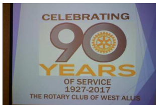
90 Years of Doing Good – Our club conducted their first meeting 4/15/1927