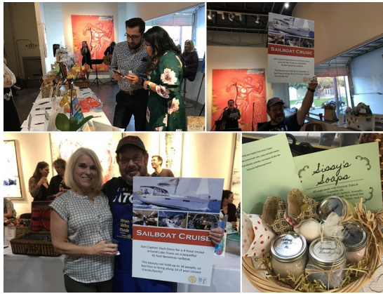
Silent and Live Auctions, MWC 2017