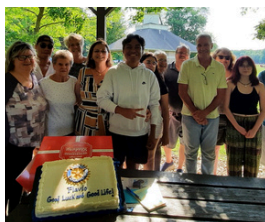
Exchange Student Pot Luck

Our members have found that it's a truly rewarding experience.