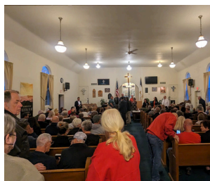
Meet the Candidates Night

Our club offers opportunities for our members - and those interested in making a difference - to get involved. Through meetings, social events, and volunteer projects, our members learn about the issues facing our community and communities all over the world, partnering with local, national, and global experts to exchange ideas about potential solutions and to draw up action plans to respond. Along with these opportunities to serve, members also are able to regularly network, resulting in lifelong friendships and business connections.