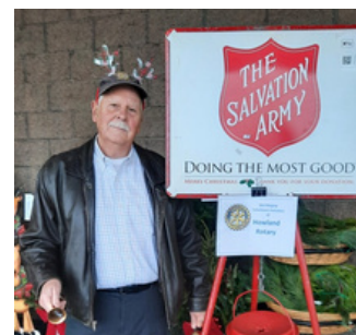
Ring the Bell for Salvation Army