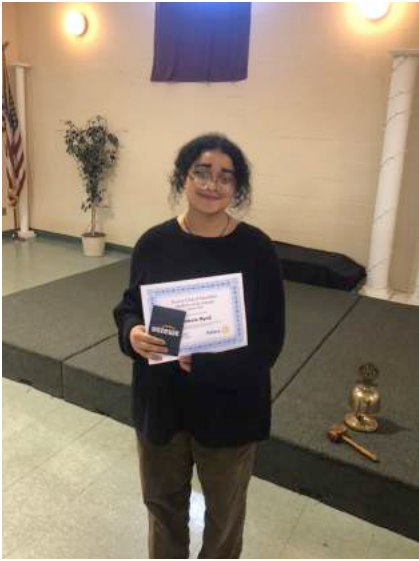
Washington High School