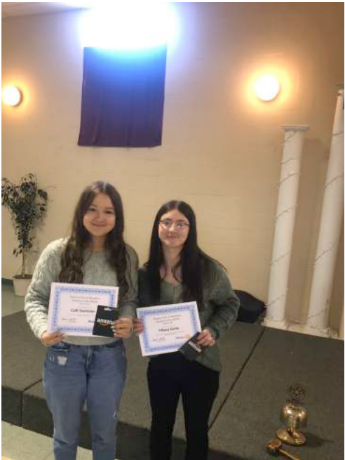
Fairless High School