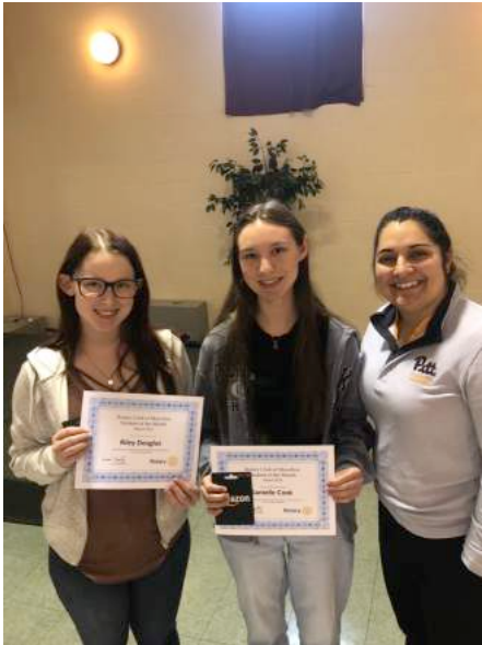
Tuslaw Students of the