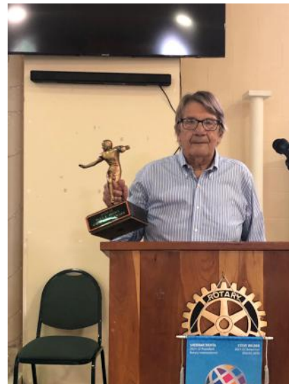
Secrets of Massillon Rotary