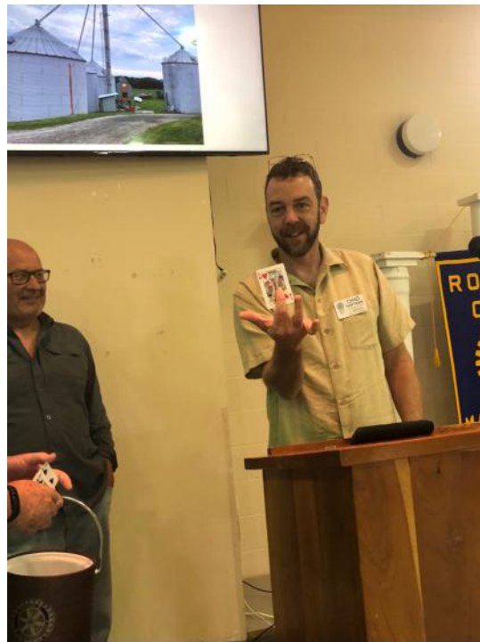
Two times in a row !??