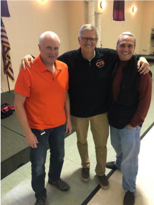
He pulled the Joker