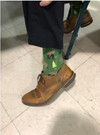
Can You name these Rotarians by their socks?