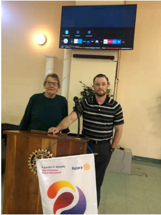
There he is again