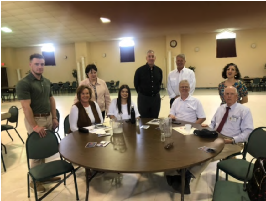
Rotary's MADD Committee