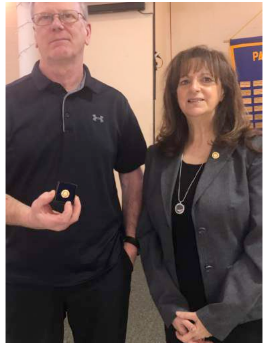
Paul Harris Award Winners