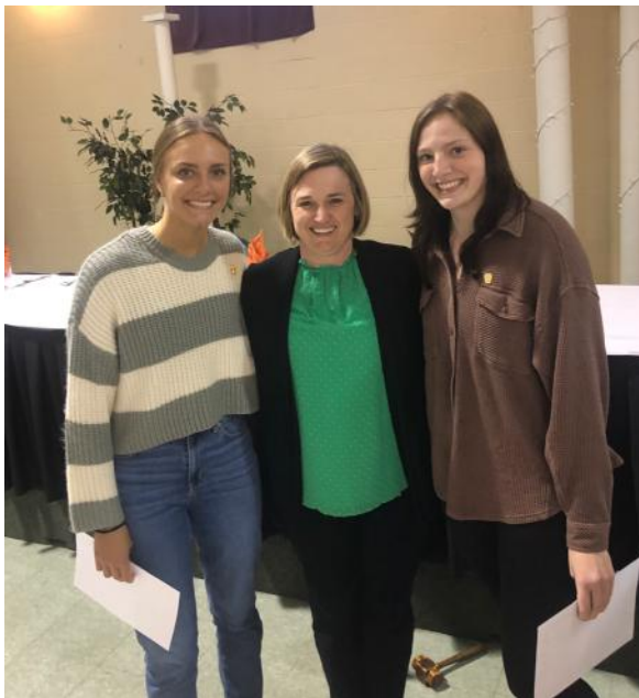
Tuslaw Students of the Month