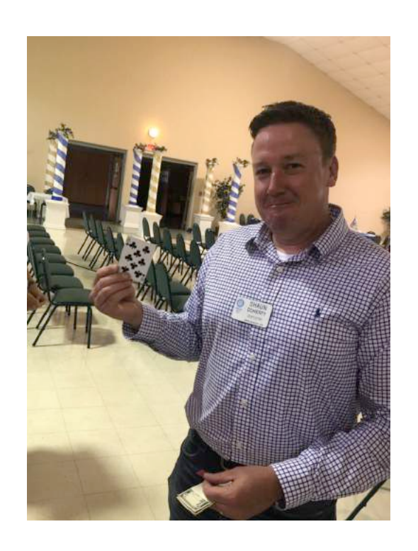
Update Massillon Health Department