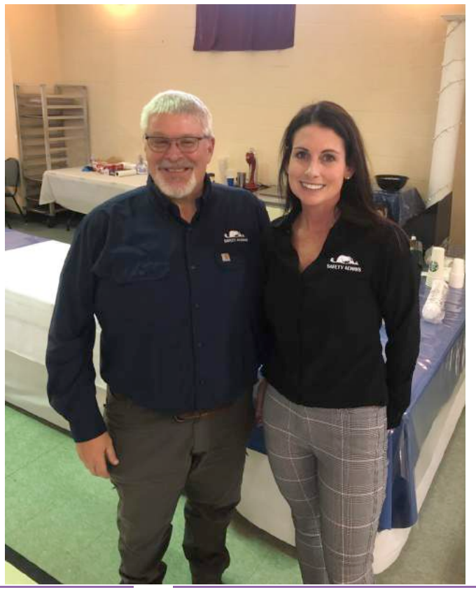
Page 4 of 11