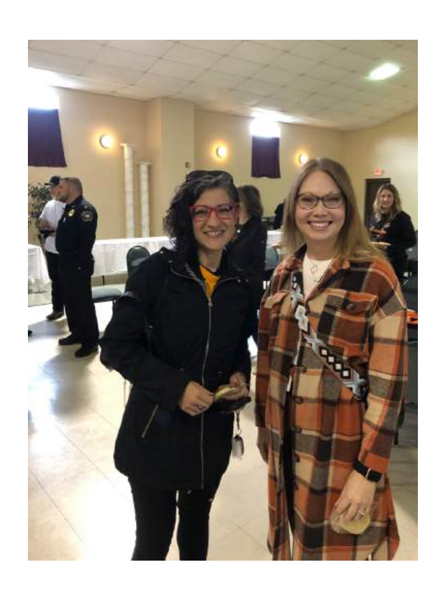
Rotary's 5<sup>th</sup> Thursday of the Month at Cherry Winery