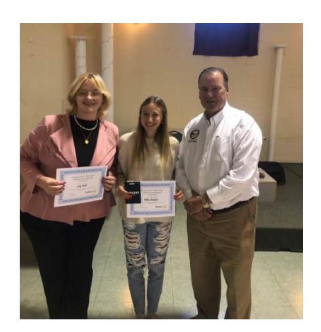
Fairless HS Students of the Month