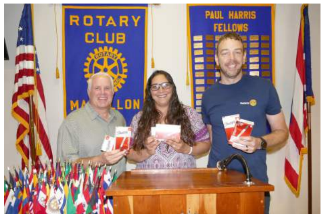
Sharpies for everyone