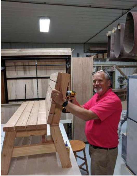
Before the Rotary logo