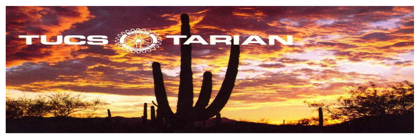
Mon Dec 19, 2011