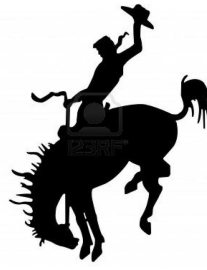
"Cowby (Ronstadt) and Indian (Wang) celebrate Rodeo Week at Rotary."