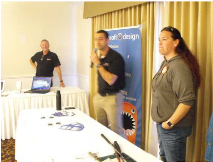
Inikrosoft Web Design