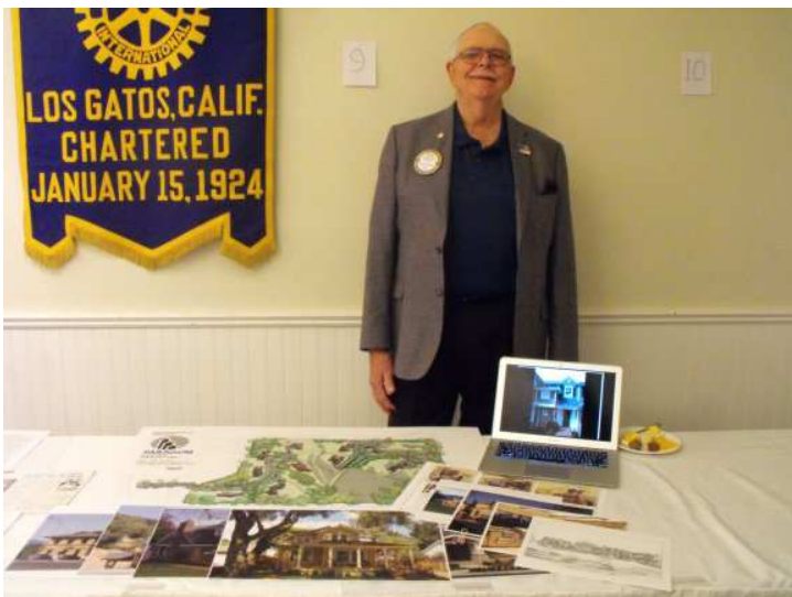
Paragon Design Group