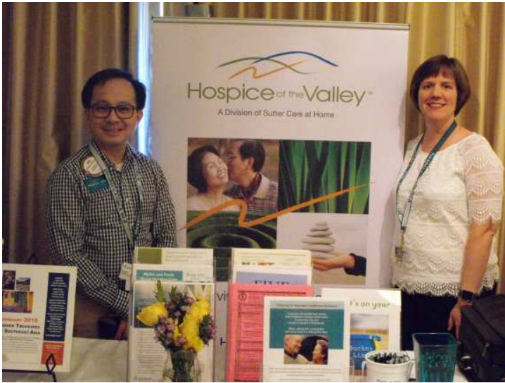
Hospice of the Valley