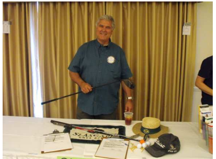
Let's Play Golf