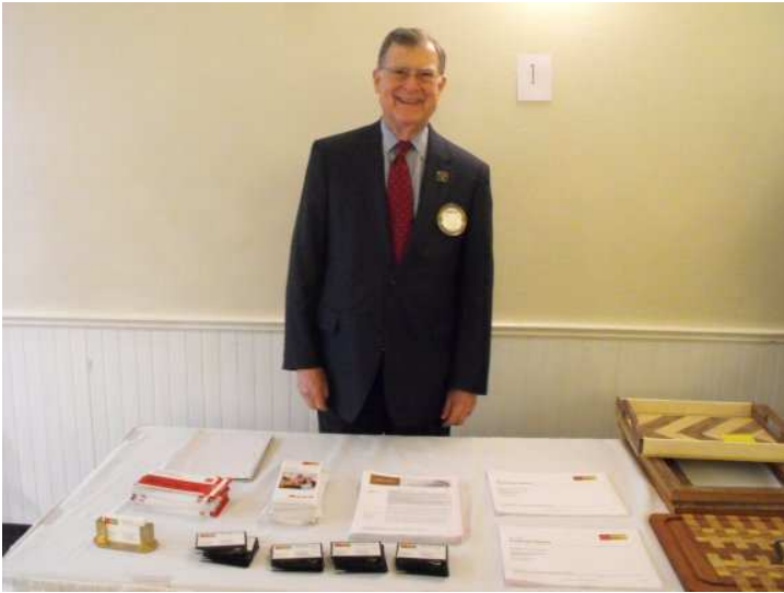
Wells Fargo Advisors