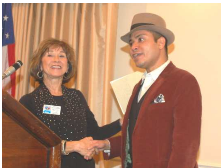
Madame President presents the famous certificate for the donation of a wheelchair in the honor of our speaker