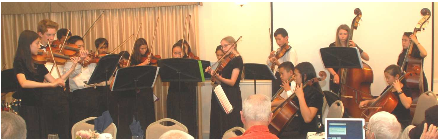
The Fisher Chamber Orchestra