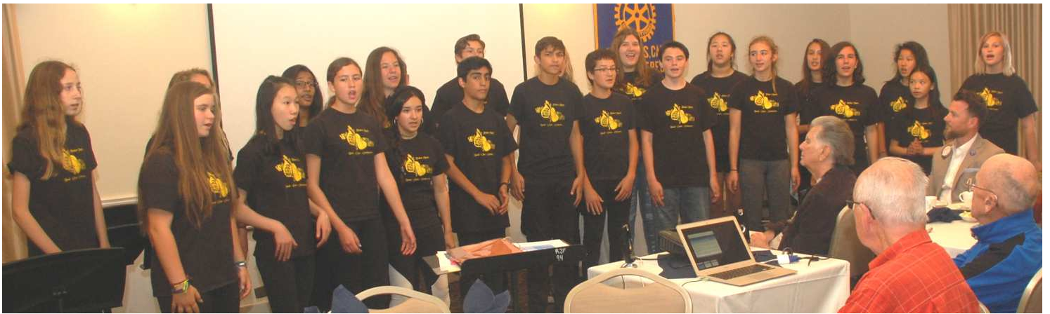
The Fisher Choir