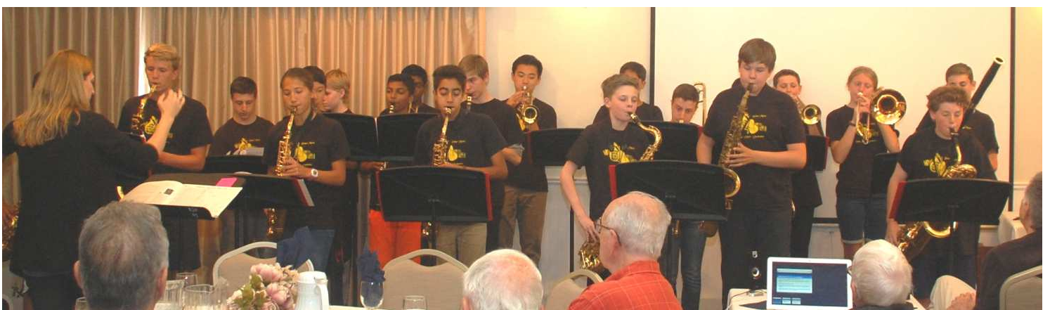
The Fisher Jazz Band