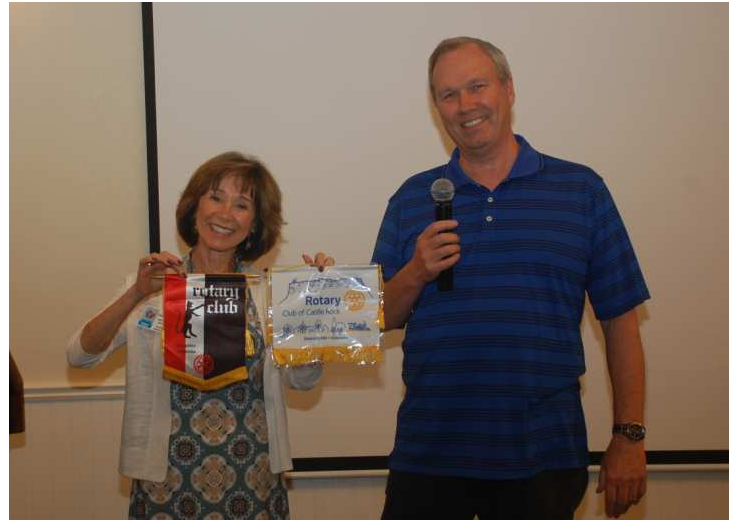
Here banners are exchanged with the Castle Rock, Colorado, Rotary Club