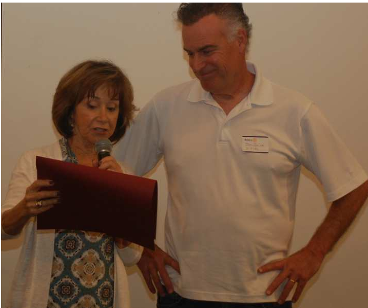
The speaker is being presented with a certificate for the donation of a wheelchair in his name