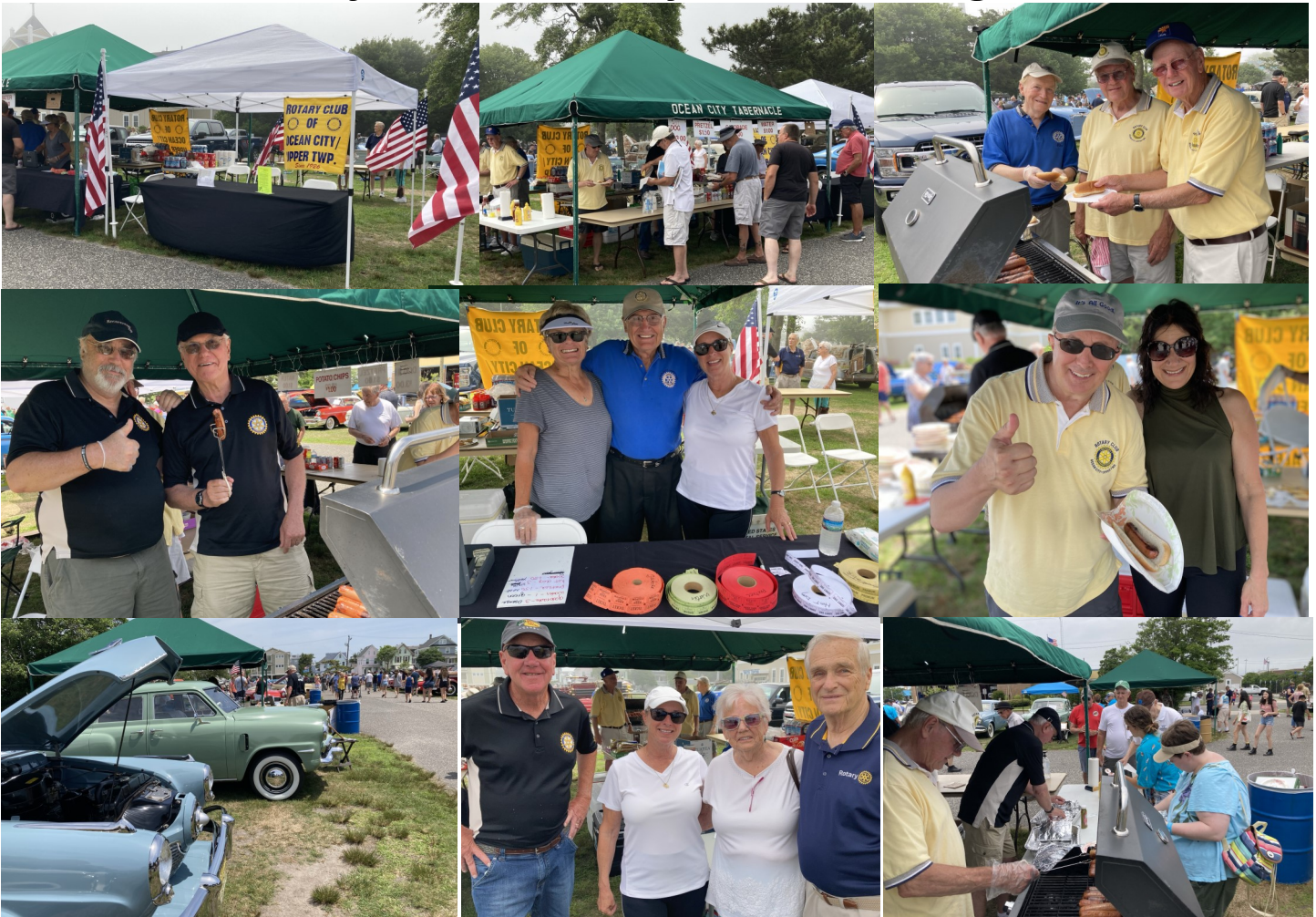
Ocean City-Upper Twp. Rotary Club with successful Hot Dog Sale at the 66th annual Dave Blyler & Herb Godfrey Memorial Antique and Classic Auto Show on the grounds of the Ocean City Tabernacle, held Saturday, 26 June 2021. Proceeds from hot dog sales support Rotary's local Youth Programs in Ocean City and Upper Township. Think about volunteering or joining your local Rotary Club and make an impactful difference in Ocean City and Upper Township.