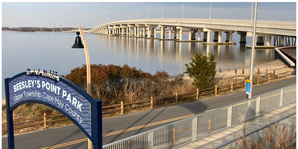
New Upper Township viewpoint, from Beesley's Pt. Park looking north to Somers Point