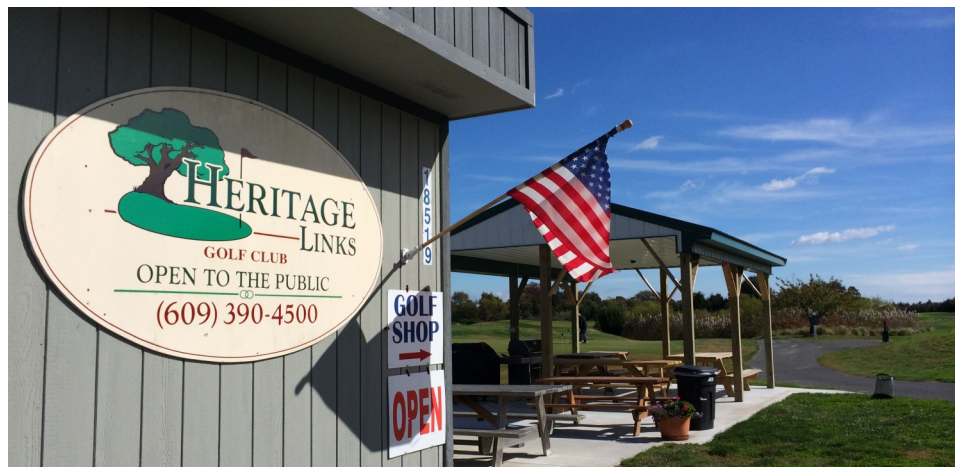
Heritage Links Golf Club > www.golfheritagelinks.com | UTBA > www.upperbiz.com