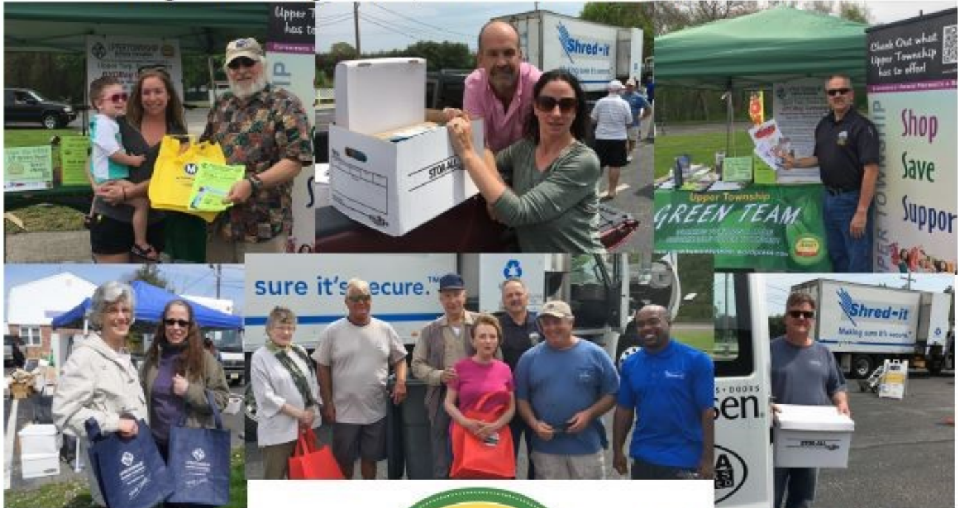
Upper Twp. SJ Green Team - File Photos - 2017

At Foglio's Flooring Center, 344 S Shore Rd., Marmora, NJ 08223