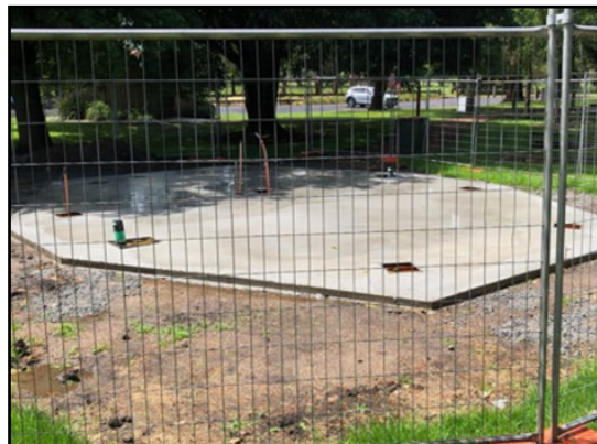
Then the saga of pouring the foundation slab emerged. Wet weather meant that we had to find 2 to 4 days of dry weather to lay the slab and let it cure. This delayed the project for some months.