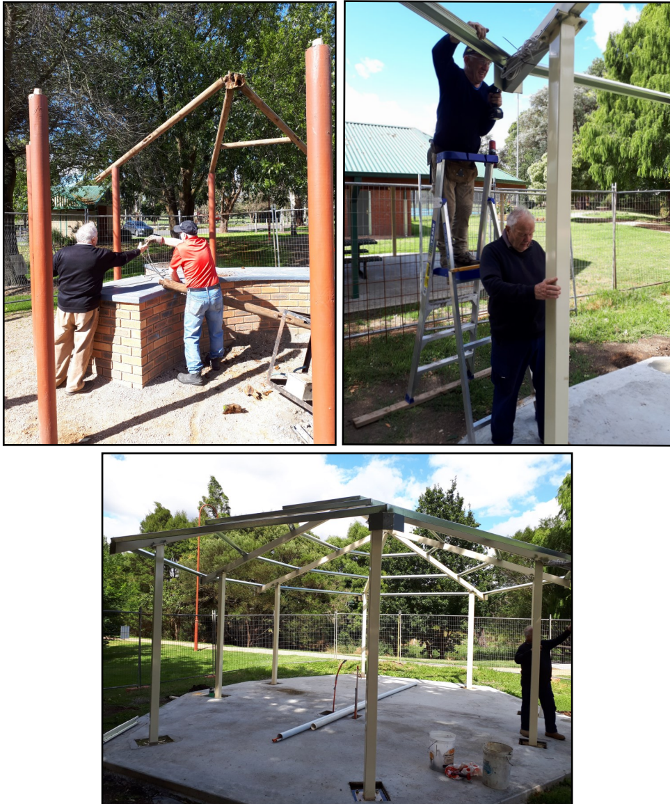
Photos of the various stages of the BBQ shelter refurbishment Aug 2022 - May 2023