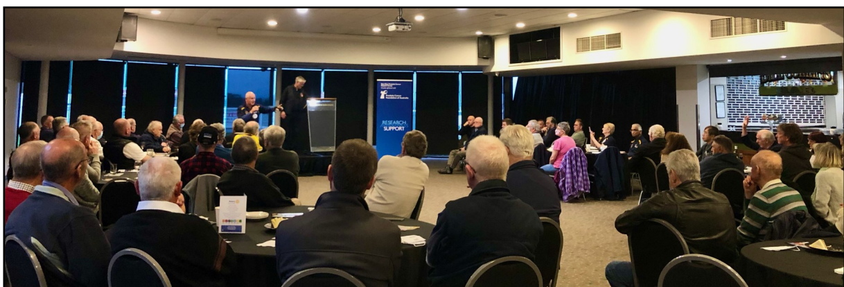
An attentive crowd at the Men's Health presentation, Moe Racing Club Function Room