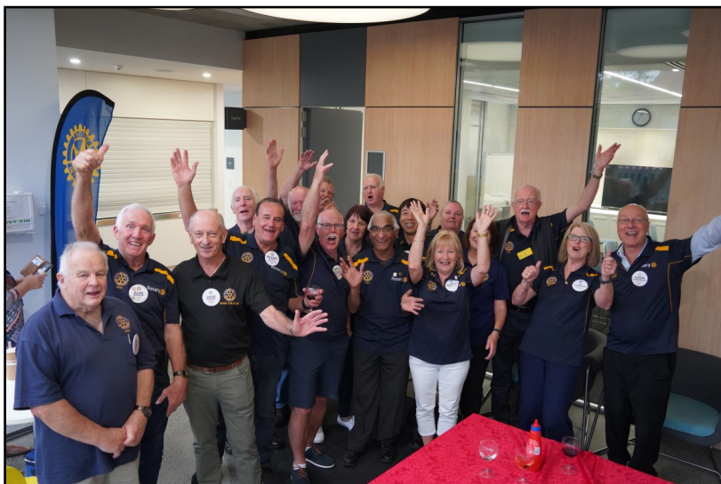
Moe Rotarians having a bit of fun!