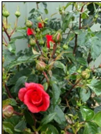
This one is "Joy of Life"