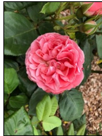
This is the "Joy of Health"

The Community service committee also took an active role in assisting the Golf Day committee with raffle set up and sales, as well as organising the cleaning roster for our club playground in the Botanic Gardens.