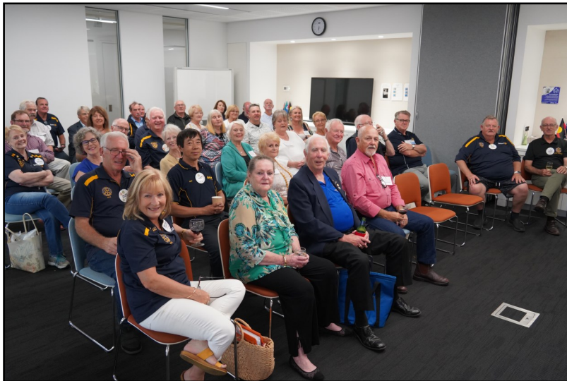
Guests and Rotarians at the 'Trip Down Memory Lane' in Jan. 2023