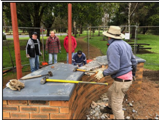
Some of the Rotarians involved really enjoyed the smashing of concrete!