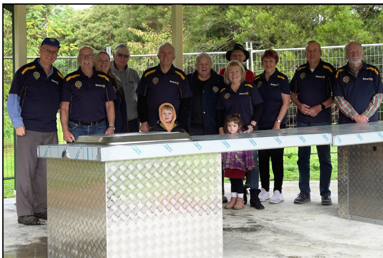
The BBQ Shelter Refurbishment Rotary Centennial Project is finally completed!