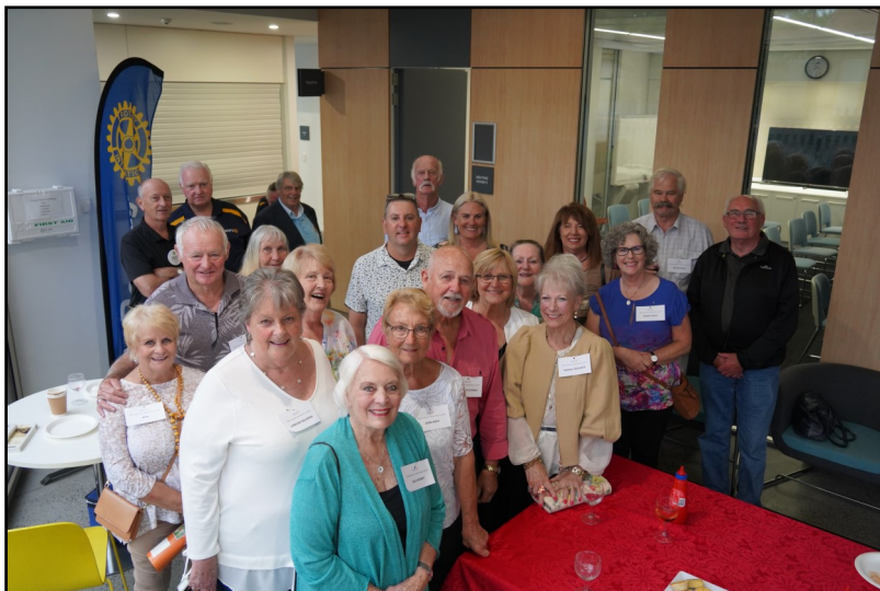
Group photo of guests who attended the 'Memory Lane' event