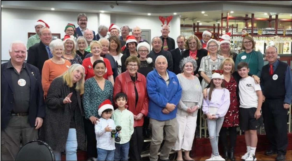
Moe Rotarians, partners, and children at the Xmas Break-Up, held at the Moe RSL