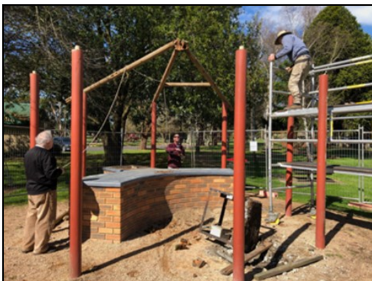
Work proceeded on the demolition in late 2022.

This project was a large and significant undertaking for the Rotary Club of Moe in cooperation with the Latrobe City Council. We applied for and gained approval for a Council Trust Grant of $15,000 for this project with a matching commitment of $15,000 from the Club.