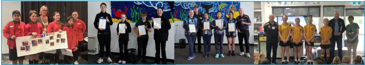
(Pictured above L to R: Participating Schools —Elizabeth St PS; Albert St PS; South St PS; Willow Grove PS)

We also once again hosted the Rotary Junior Community Awards program, with students presenting their achievements at the Club in the presence of their families and teachers. This continues to be a highly valued and popular program within our local schools.