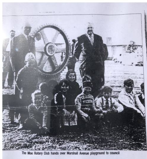
The Moe Rotary Club hands over Marshall Avenue playground to council