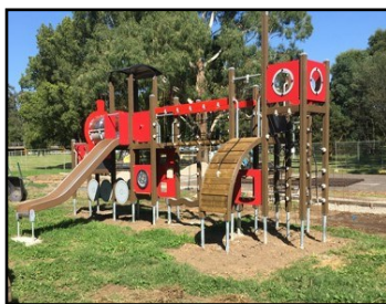
New Playground in Botanic Gardens