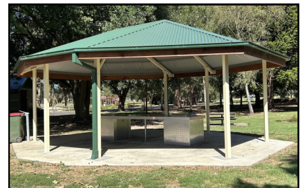
New BBQ shelter in Botanic Gardens