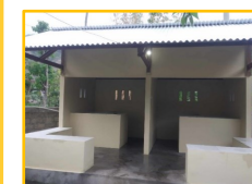
Our latest project was to install new toilets and tuck shop to replace old toilet block that was demolished