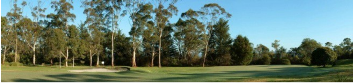
YALLOURN GOLF CLUB Golf Links Rd, Yallourn Heights.

Y allourn Golf Club is home to the GIPPSLAND ROTARY GOLF CLASSIC and is one of the finest courses in the Latrobe Valley if not Victoria. Each fairway is a picture of beauty with excellent views of the country side available from anywhere on the course.