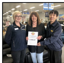
Major Raffle Prize Winners