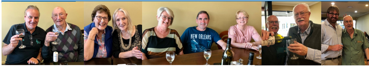
Members enjoying fellowship at local Restaurants