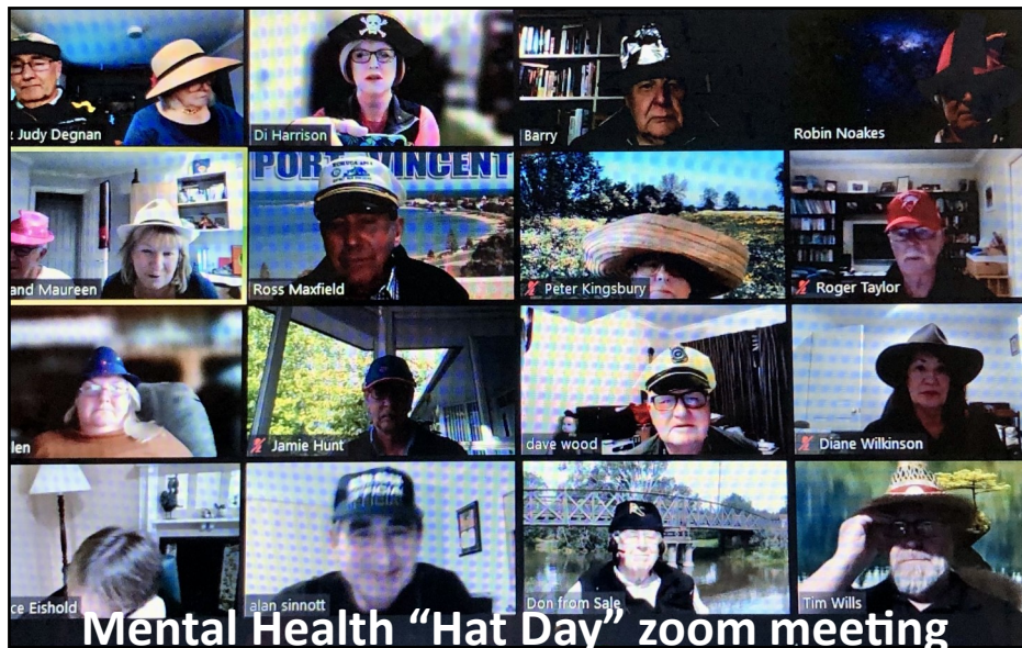
Mental Health "Hat Day" zoom meeting