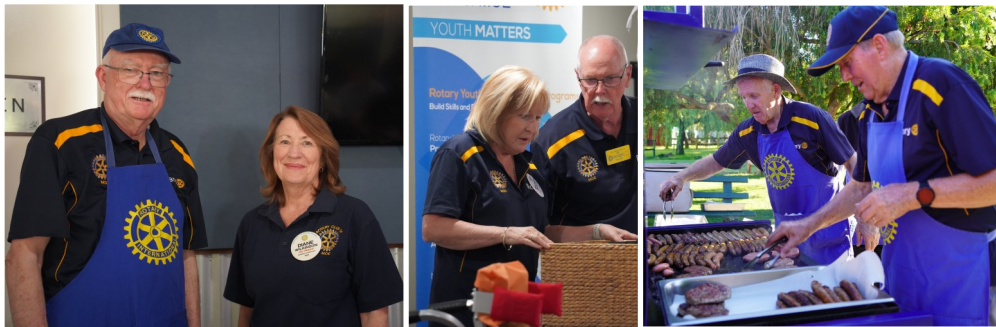
Pride of Workmanship helpers