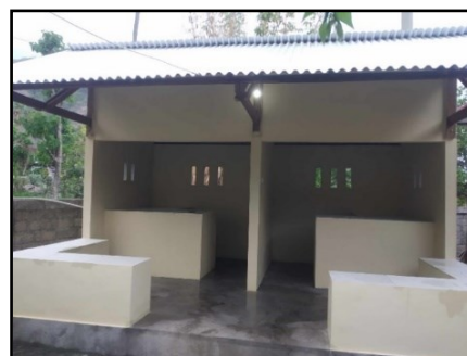
Completed tuck shop

This project supported a number of Rotary Areas of Focus, including supporting education through better facilities for the students, improved sanitation and hygiene with the provision of new toilets and handwashing facilities, and growing local economies through the use of local tradespeople and materials. This project brought direct benefits to the school students and teachers and by extension, benefits to the broader community.