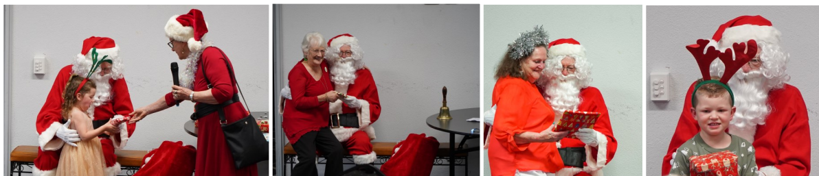
Christmas break-up fun