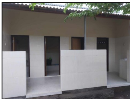
Completed toilet block