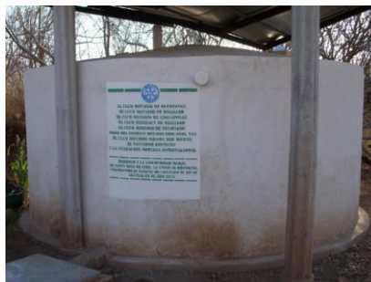
Rain cistern in El Salvador with thanks to El Club Rotario de Delaware