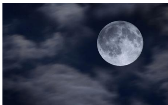
June full moon (June 12)