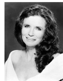
June Carter Cash